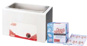
Clean&Simple™ Ultrasonic Cleaners and Tablets

Documents: date, time, temperature, pressure.