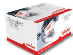
Chamber Brite Autoclave Cleaner