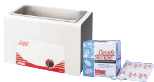
Clean&Simple™ Ultrasonic Cleaners and Tablets

Documents: date, time, temperature, pressure.