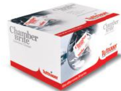
Chamber Brite Autoclave Cleaner