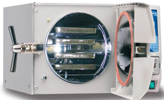
EZ10 with 4 large trays

* Above photo shown with optional printer